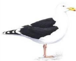
Great black-backed gull