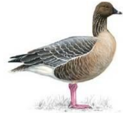
Pink footed goose