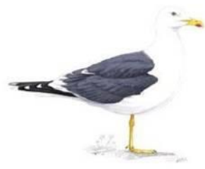
Lesser black-backed gull