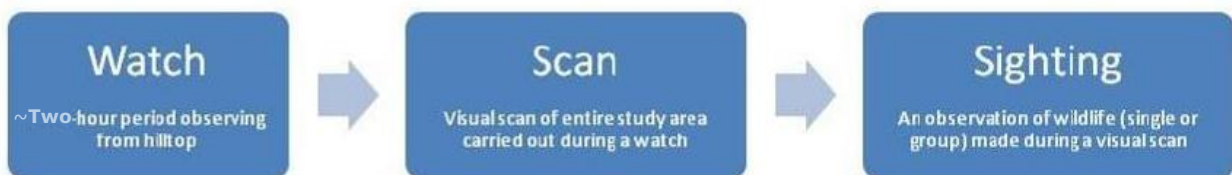
Figure 1. Definitions of a watch, scan, and sighting used in this methodology.

This land-based study will record wildlife sightings (detailed in section 4) during daily watches (section 3.1) by making regular scans of the study area (section 3.2) in a consistent manner. The definitions of each of these processes are provided in Figure 1.