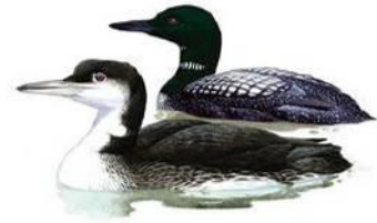
Great northern diver