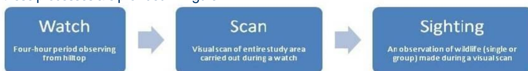
Figure 1. Definitions of a watch, scan, and sighting used in this Methodology.

This land-based study will record wildlife sightings (detailed in section 4) during daily watches (section 3.1) by making regular scans of the study area (section 3.2) in a consistent manner. The definitions of each of these processes are provided in Figure 1.