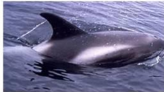
White beaked dolphin

The white beaked dolphin is a stout dolphin, about 2.5-2.7m in length; it has a short, often white beak, and black back and a pale grey to white area behind the dorsal fin that extends to a blaze on the flanks. This forms a diagnostic "saddle" on the back. Mean dive duration: 20 sec.