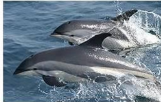
White sided dolphin

This bulky dolphin can be confused with the white beaked dolphin and often forms mixed groups with this species. It reaches around 3m in length and can be distinguished from the white beaked dolphin by its all-black back and elongated yellow-ochre band on its flanks. Mean dive duration: 20 sec.