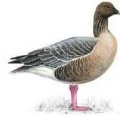
Pink footed goose