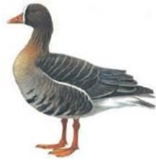
White fronted goose