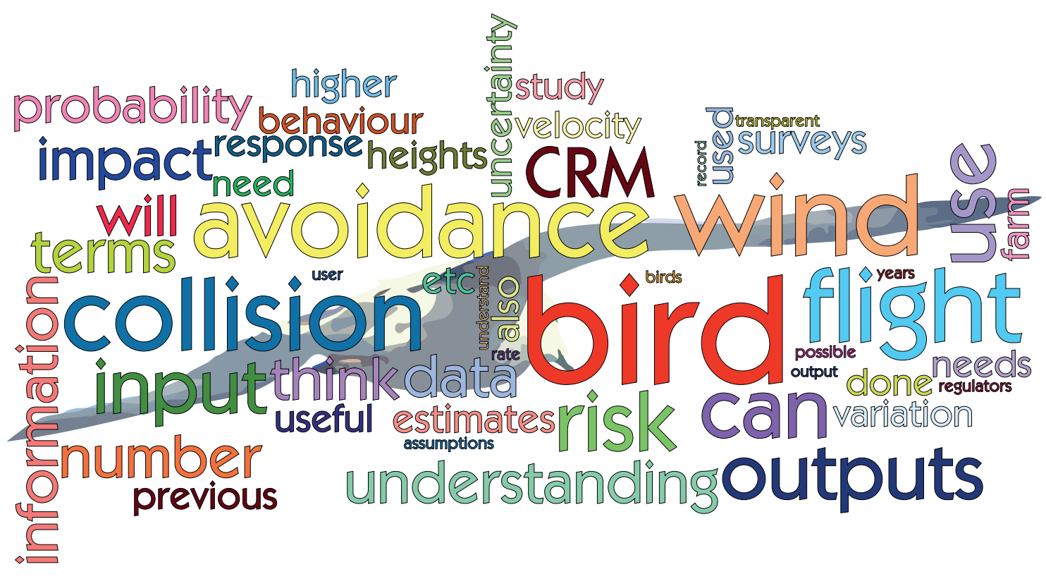
FIGURE 1: WORD CLOUD ANALYSIS RESULTS OF RESPONSES TO SURVEY QUESTION 13